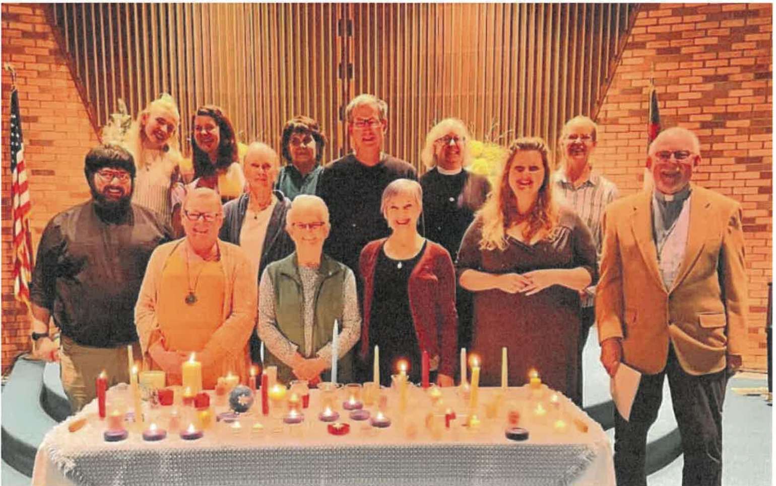
Top: a variety of members donned costumes to act out the story of Jesus' birth. Bottom: Five area churches participated in a "Longest Night" service with music, meditations, and readings.